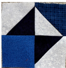
trim 4 1/2"

Unit 3: Sew unit 1 to unit 2 making square below. Make 4. Look at picture above as each square is constructed differently. Sew white 2½" x 4½" rectangle between Unit 3 squares.