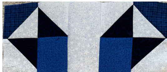
trim 4 1/2" x 10 1/2"