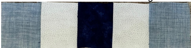
Trim 2 ½" x 10 ½"

Row 2: Sew Fabric A/Fabric D- rectangle to each side of Fabric B–center square.