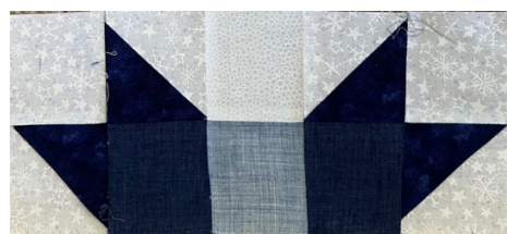
Row 1 and Row 3 (turn upside down)

Sew Fabric A, 2 ½" square to Fabric D square – Make 4, Use in rows 1, 2, and 3.