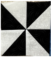
trim 4 ½"

Sew 4 ½" square pinwheel to each side of Fabric D-Blue print rectangle. Rows 1 & 3