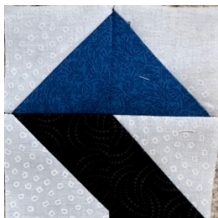
trim 4 ½"

Sew a Unit 1 square to each side of Fabric D-Purple rectangle. Watch direction of square.