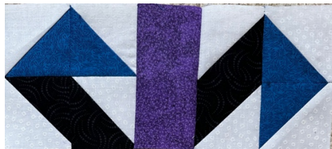
Row 1 (above). Rotate for Row 3