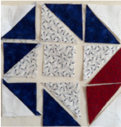
Upper Left Block: Fig 3

Be sure to trim all triangle squares to 2 1/2". Sew squares in order as shown in picture. Trim the following 4 blocks to 6 1/2" each.