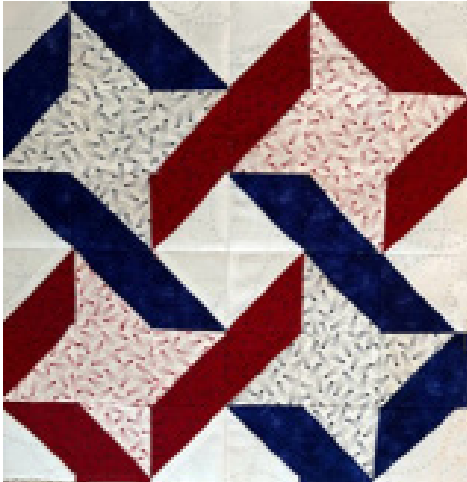
Jan's Block Fig 1