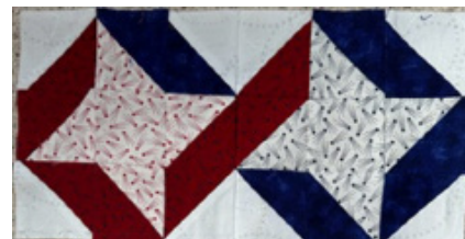
Lower Blocks Fig 8