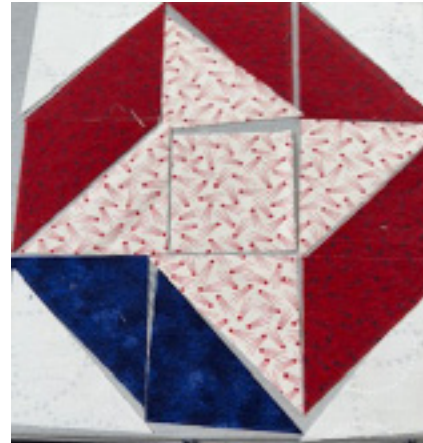
Upper Right Block: Fig 4