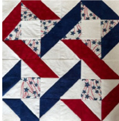
Fig 2 Carolyn's Block