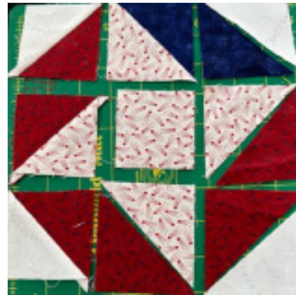
Lower Right Block: Fig 6

Sew upper left block to upper right block. Sew lower left block to lower right block. Then sew the upper blocks to the lower blocks. Matching seams and pressing seams open. Trim block to 12 1/2"