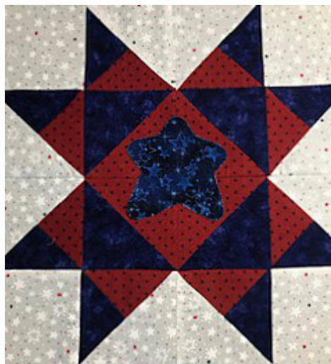
Fig. (1 added star for fun)