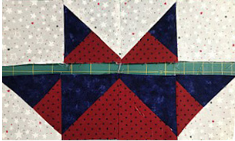
Rows 3 & 4 - Fig. 7