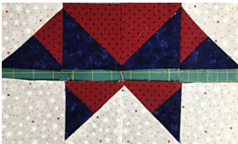
Rows 1 & 2 - Fig. 6